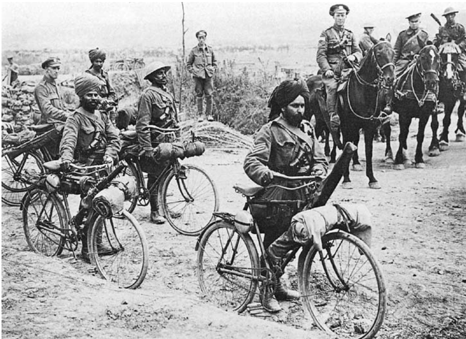
Images 7. Indian Soldiers on Bikes.