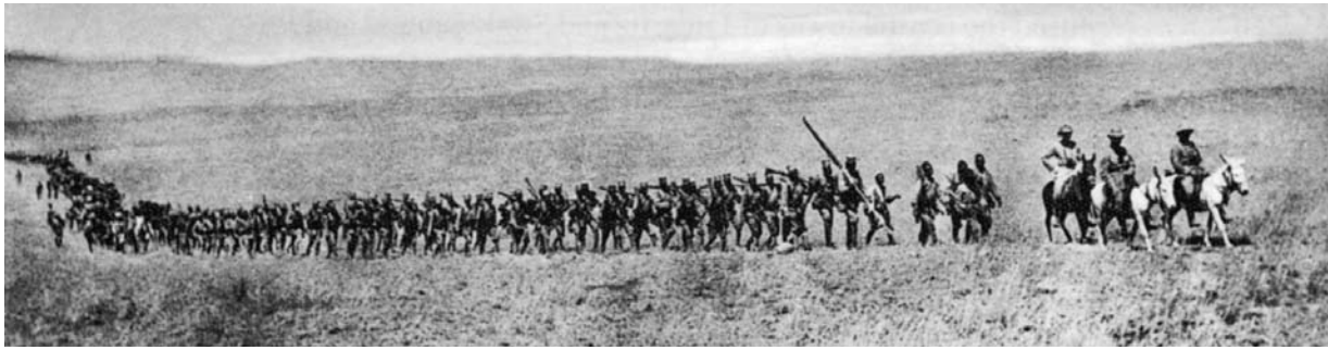
Image 12. German Colonial Troops in East Africa.