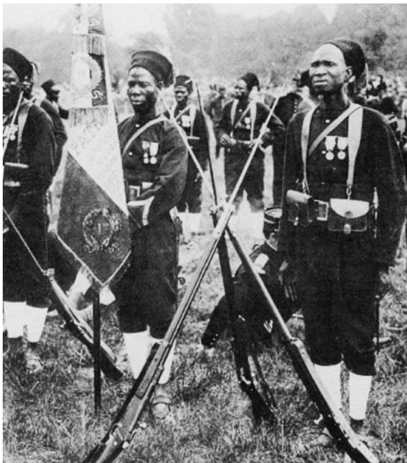
Image 10. French Senegalese Troops on Parade.

From Hew Strachan, World War I: A History .