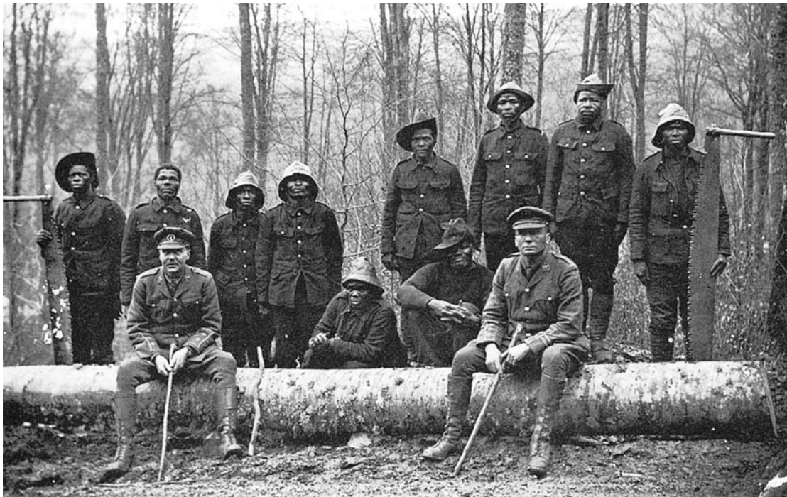
Image 9. South African Labor Corps.

From Hew Strachan, World War I: A History .