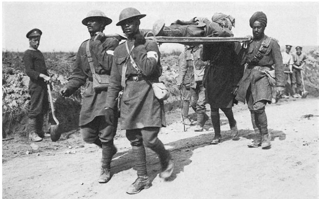
Images 8. Indian Stretcher Bearers.