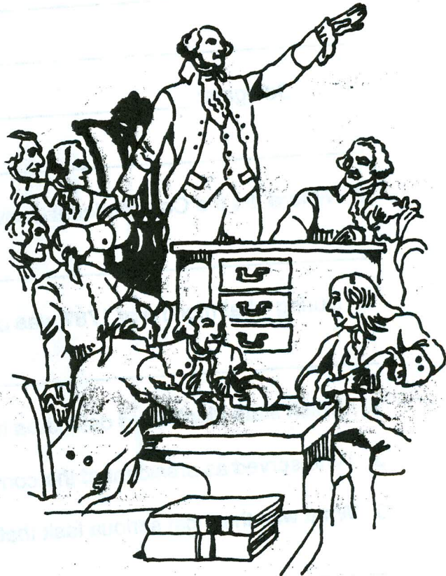
George Washington was chosen as the president of the Constitutional Convention.

The Constitution that resulted from this historic convention is now over 200 years old. Few written constitutions have lasted as long as the Constitution of the United States.